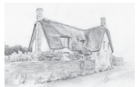
Sam's Sketches - pencil drawing