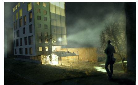
Model and Photoshop Rendering